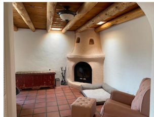
SW Fireplace in LR