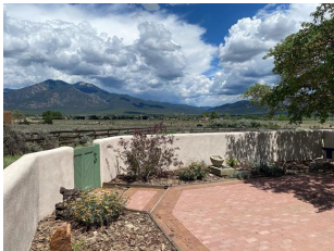
Dining Patio off of LR