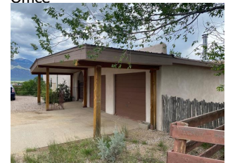
2 car gar w/2 car carport