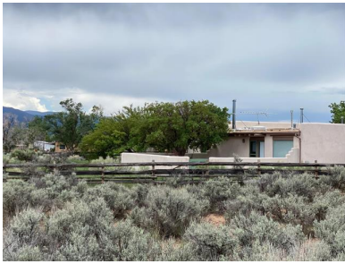
9 Llama Rd

MLS # 109114 Class RESIDENTIAL Type Single Family Area BLUEBERRY HILL (07A) Asking Price $675,000 Address 9 Llama Rd City El Prado State NM Zip 87529 Status Active Sale/Rent For Sale IDX Include Y